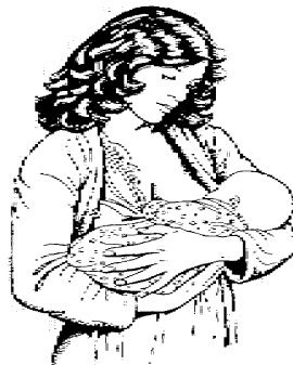
Tomorrow's Society requires Today's parents...