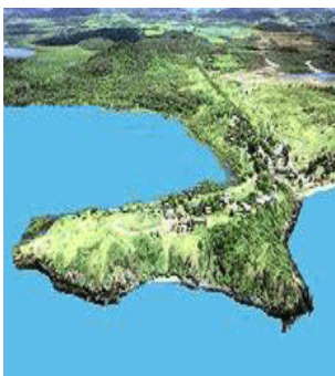
Above: Freshwater Point near Sarina. Right: Map of ancient Tyre

keyed into a reef constructed of placed andesite boulders set in slag furnace cement with a back fill road of mined ore stone. The North Harbour jetty is of col-