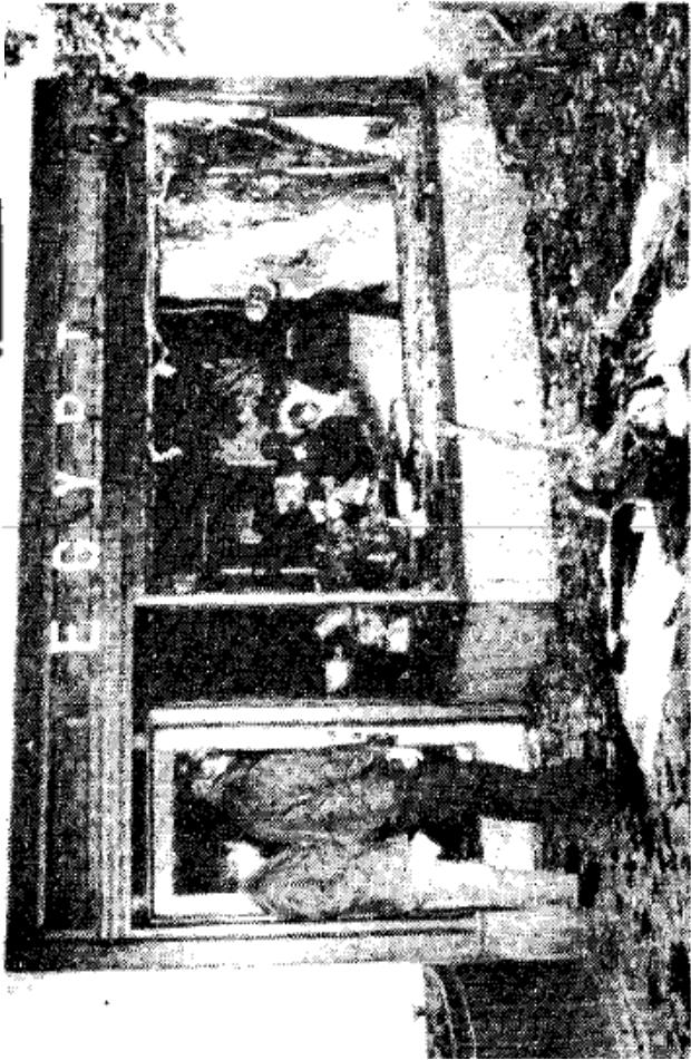
in an arson attack. The Jewish Defense League claimed credit for the latter terrorist attack. The FBI, following a White House directive, won't list the attack on the IHR because President Reagan doesn't want to embarrass America's "favorite ally". The attack on the Egyptian office, which occurred in 1981, made a previous list.